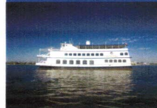
Cruise Around Charleston Harbor