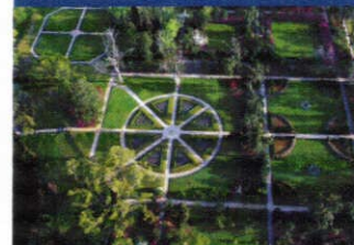
Visit Middleton Place and Gardens