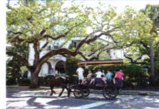
Tour Charleston by Horse and Carriage