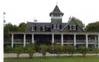
Tour Historic Magnolia Plantation

Departure: Topeka, KS @ 8 am, then Lawrence, KS @ 8:45 am then Kansas City, KS @ 9:30 am