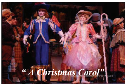
"A Christmas Carol"